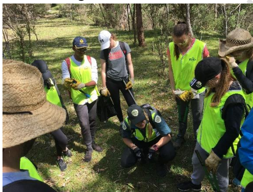
Photo: One of the Year 9 House teams working on their environmental service project.