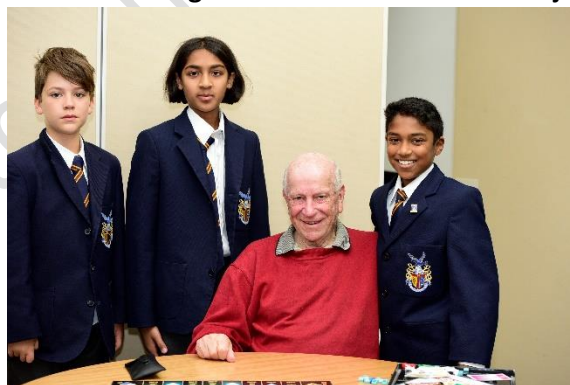
Photo: Year 6 students working on their service project with senior citizens at a local retirement village.